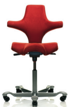
HÅG Capisco 8106