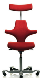
HÅG Capisco 8127