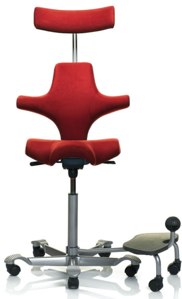
HÅG Capisco 8107 w/optional HÅG StepUp®