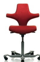
HÅG Capisco 8126