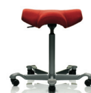
HÅG Capisco 8105