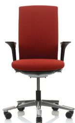
HÅG Futu 1020 w/optional armrests