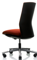
HÅG Futu 1020