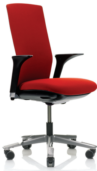
HÅG Futu 1020 w/optional armrests