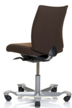
HÅG H05 5200