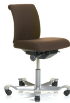
HÅG H05 5100