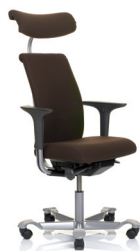
HÅG H05 5500 w/optional headrest