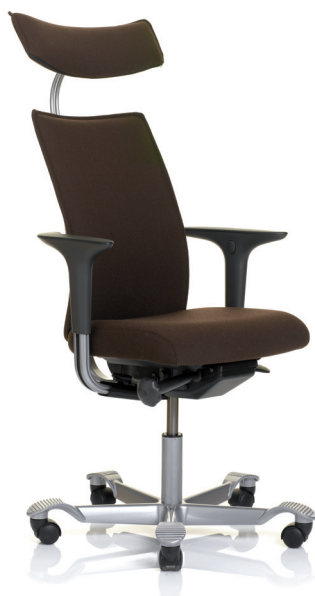
HÅG H05 5600 w/optional headrest