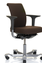
HÅG H05 5300